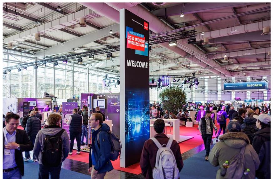
Image of the “5G & Industrial Wireless Arena” at HANNOVER MESSE 2025